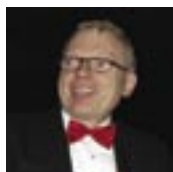
Lord Hunt of Kings Heath Parliamentary Under Secretary (Lords) Minister for Health and Safety Department for Work and Pensions

"I am pleased to write in support of the new Concrete Targets 2010 scheme aimed at reducing accidents and injuries in the precast concrete products industry. In September 2005 I was asked to present the Concrete Targets certificates to the members of British Precast who have been making excellent progress since the start of the previous scheme. A combined reduction of 45% in accident and lost time in four years to 2004 is a worthy achievement; yet as the industry itself says, there remains much to do to improve the sector's record. I strongly urge all manufacturers of concrete products, especially the small and medium sized producers, to now sign up to the Concrete Targets scheme. As the Federation states – 'Best Practice in Precast is Good Business'"