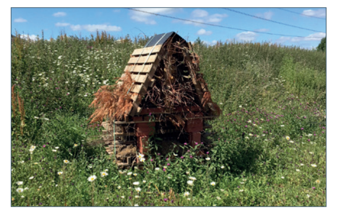
Aggregates Industries 'Bugs Hotel' – winner of the British Precast 2018 Sustainability Awards.

99.2% of reported employees were covered by formal training and development policies in 2018. An average of 22.8 hours of training per employee was provided.